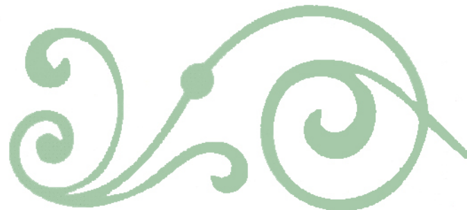
A. Saghei The Dry Clean Spa